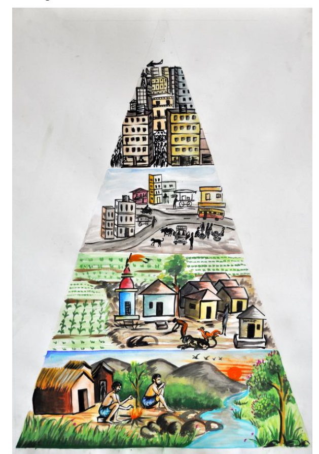
Under Threat from Climate Change and Resource Depletion