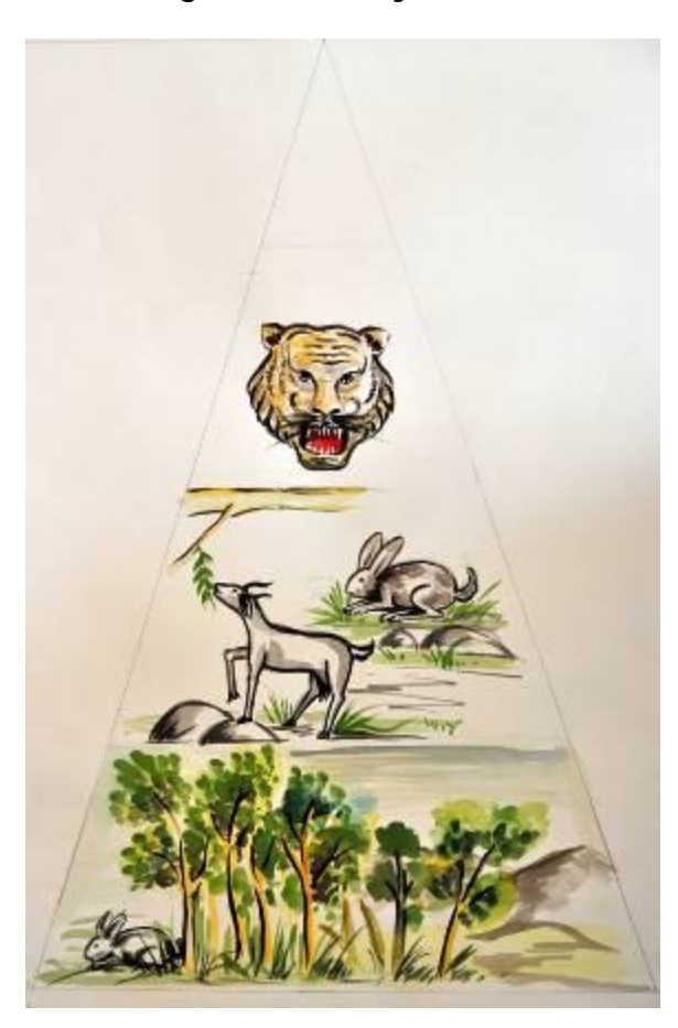
Tiger at the top of the Pyramid

Human Ecological Pyramid: Megacities dependent on Rural Ecosystems and Forests